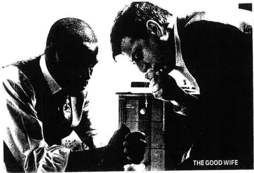
THE GOOD WIFE